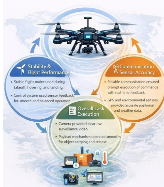
Fig. 3: Experimental Results of Sensor-Based Drone System